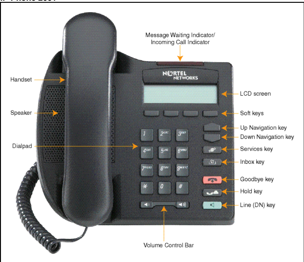
Figure 1 IP Phone 2001